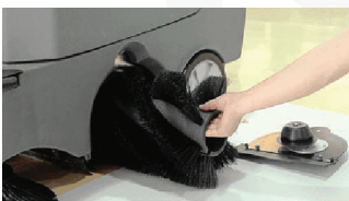
Main rolling brushes can be easily assembled, dismountable for replacment.