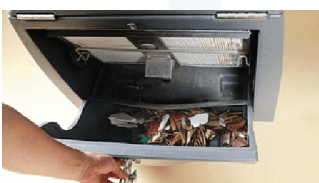
Rear dismountable garbage box, easy dumping.