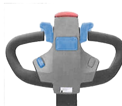
Frei tiller head (option)