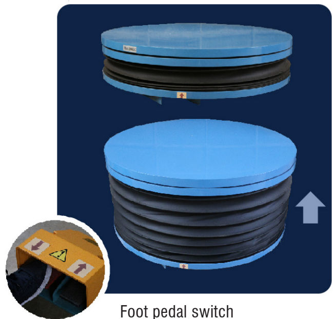
Foot pedal switch